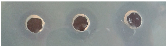
Fig. 3. Zones of growth inhibition on R. vitis ONU 388 lawn caused by the supernatants of L. plantarum ONU 87, ONU 206 and ONU 991 (from left to right)

Thus, the presence of genetic sequences indicates the potential ability of the strain to synthesize bacteriocins but did not allow to make a preliminary conclusion about the active production of antagonistic substances into a medium.