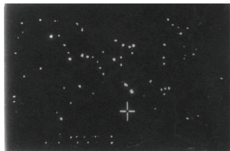
FIG. 1. Image of artificial stars given by the sensor (250x250 pixels)

The sensor was based on a CdS-Cu 2 S heterojunction. A thin-film sandwich arrangement is deposited by vacuum evaporation on a glass substrate. A thin Cu film and a transparent conducting SnO 2 layer provide the integral contacts to the p- and n-sides of the heterojunction, respectively. A 256 level video-signal readout is obtained by scanning the surface of the sensor with a point IR probe. Our computer set-up provides the output data in two formats: 128x128 pixels with 16 grey levels and 250x250 pixels with 32 grey levels.