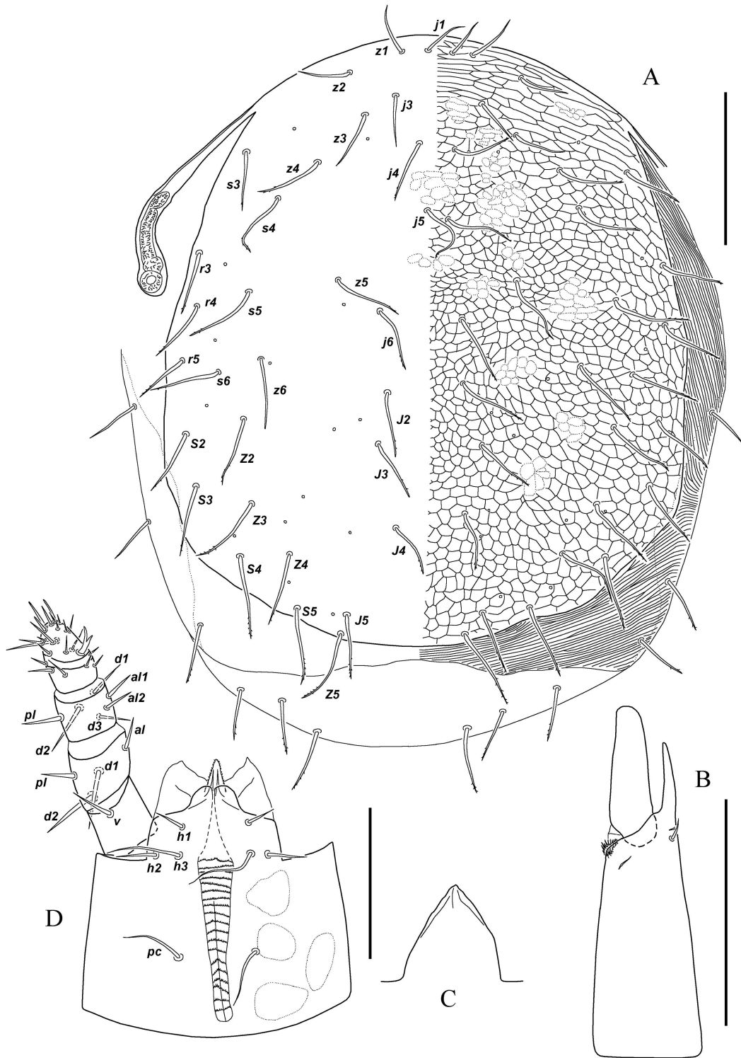
Figure 1 Myrmozercon patagonicus n. sp., female: A – idiosoma, dorsal view; B – chelicera; C – gnathotectum; D – subcapitulum and palp. Scale bar: A 200 \mu m, B–D 100 \mu m.