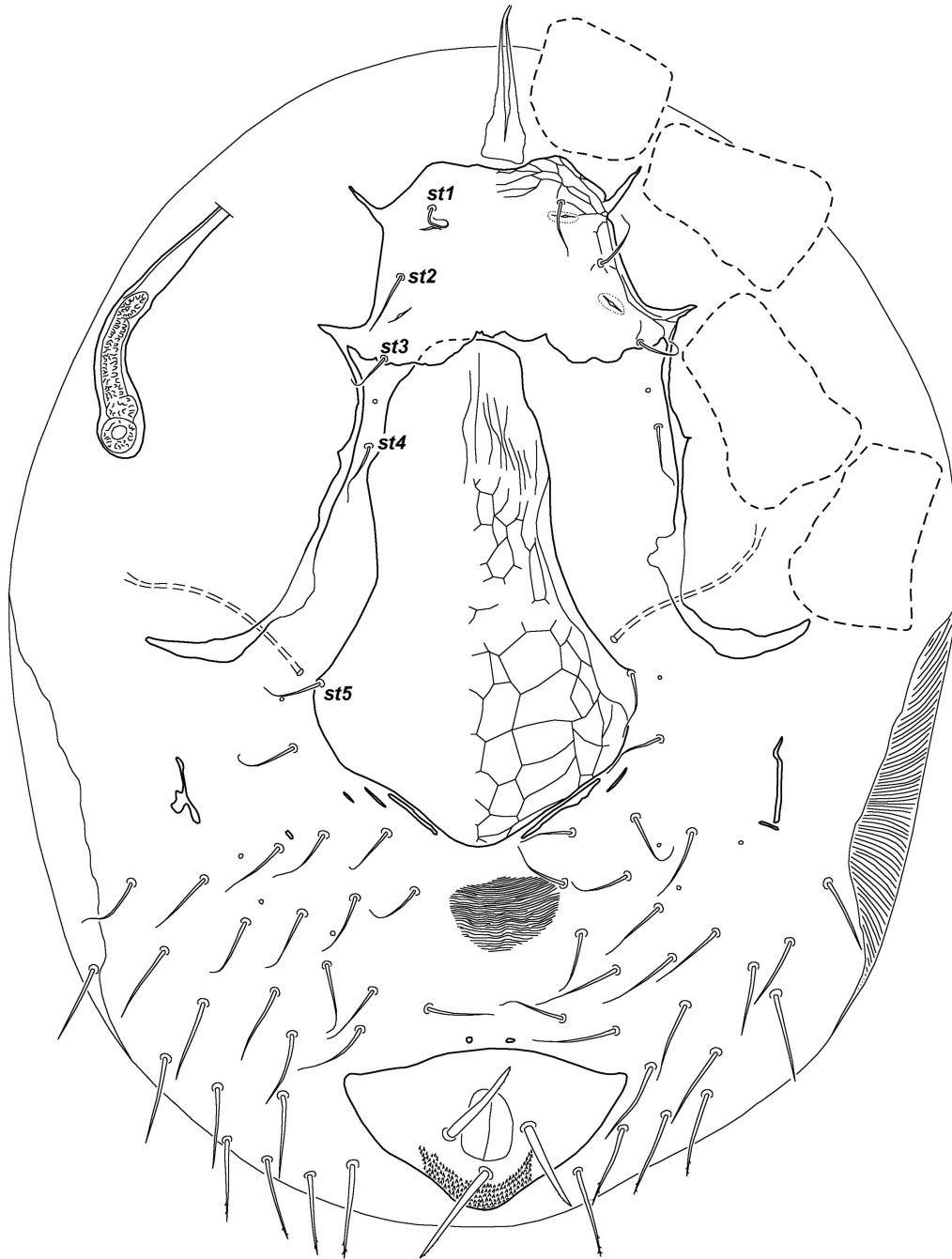
Figure 2 Myrmozercon patagonicus n. sp., female: idiosoma, ventral view. Scale bar 200 \mu m.