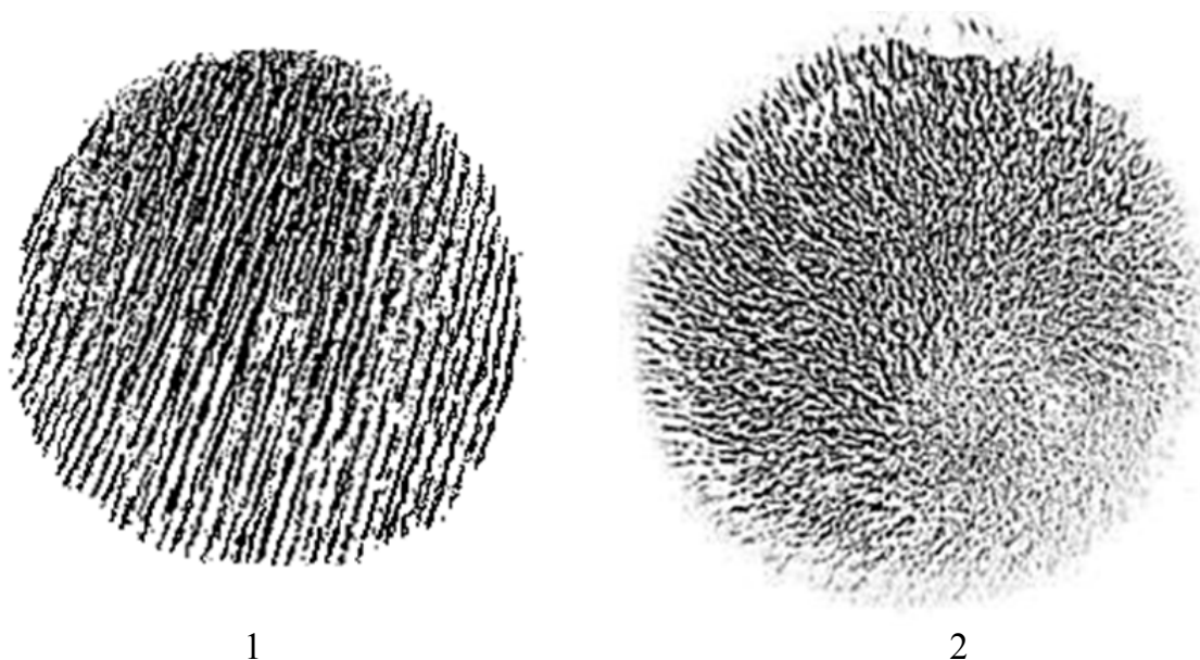
Fig.1. Radiographs of sample PCM disks with "fibers" oriented: 1) in the disk plane and 2) normal to disk.

permolecular levels, and, due to the appearance of orderly structures, to anisotropy. The polymerization of the composite in the field with the magnetic induction ( B = 200 mT) changes the processes of structure formation in the boundary layers of the polymer/filler particles, which also affects the properties of the compound [5].