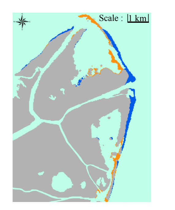
Fig 4 – Coastline dynamics of the Ochakiv Arm in 2000–2007.