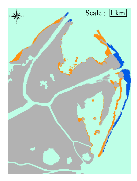
Fig. 2 – Coastline dynamics of the Ochakiv Arm in 1986–1993.

Thus, a series of vector maps was produced, showing the dynamics of a form and location of the marine delta coastline of the Ochakiv Arm for the above-mentioned periods (Figs. 2, 3, 4, 5, 6).