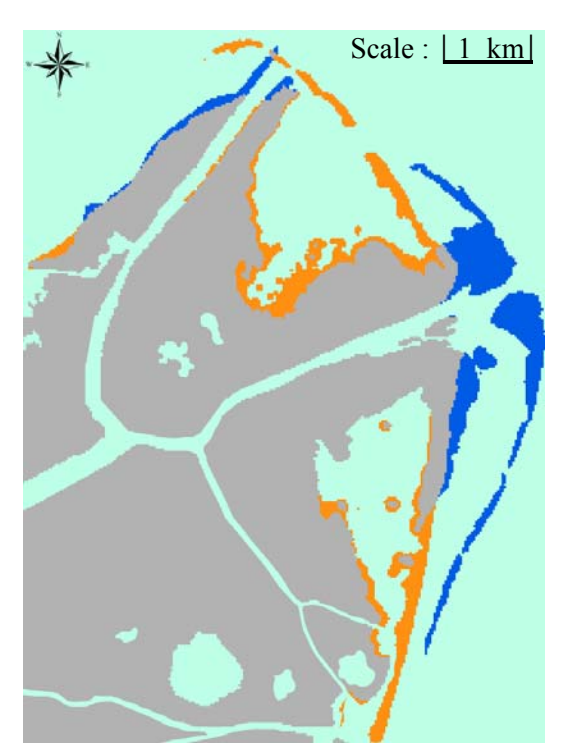
Fig. 6 – Coastline dynamics of the Ochakiv Arm in 1986–2011.

A map legend is identical for all the coastline dynamics maps: grey color indicates location of delta objects in the initial year of each period; blue ones are areas of the sea encroachment for the last year of each period; orange – areas of newly appeared land.