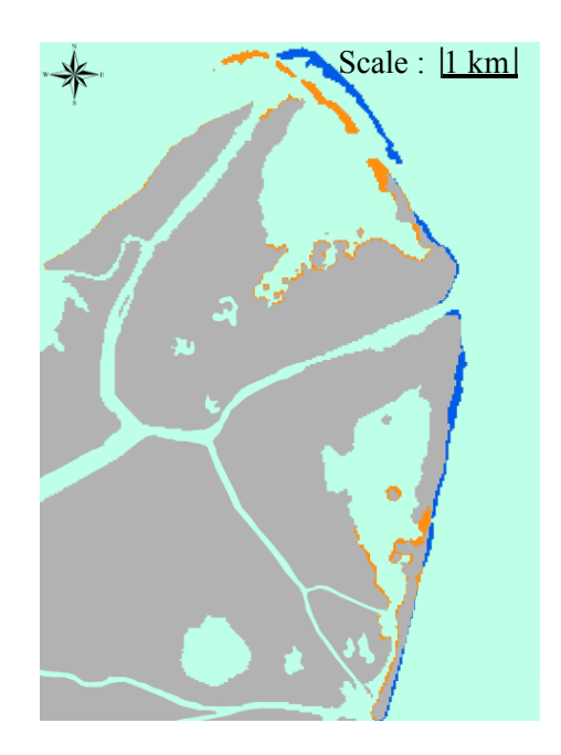
Fig. 5 – Coastline dynamics of the Ochakiv Arm in 2007–2011.