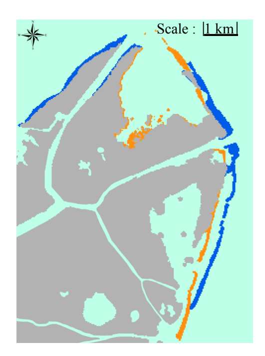
Fig. 3 – Coastline dynamics of the Ochakiv Arm in 1993–2000.