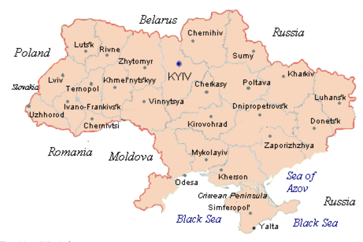
Fig 1. Map of Ukraine⁴.

Therefore, the main element of branding of UTC is the unique features of cultural tourism objects located in the Southern megaregion of Ukraine, which includes Mykolaiv, Odesa and Kherson regions (fig. 1).